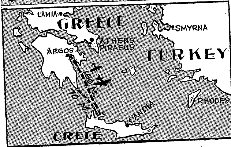
Circle on top map of Crete indicates chief area of German air attack in which troop-carrying gliders and parachute troops were used. Probable routes of German planes from bases on the mainland of Greece are marked on bottom map.

Handwritten notes: # 149 1000 1000 1000 1000 1000