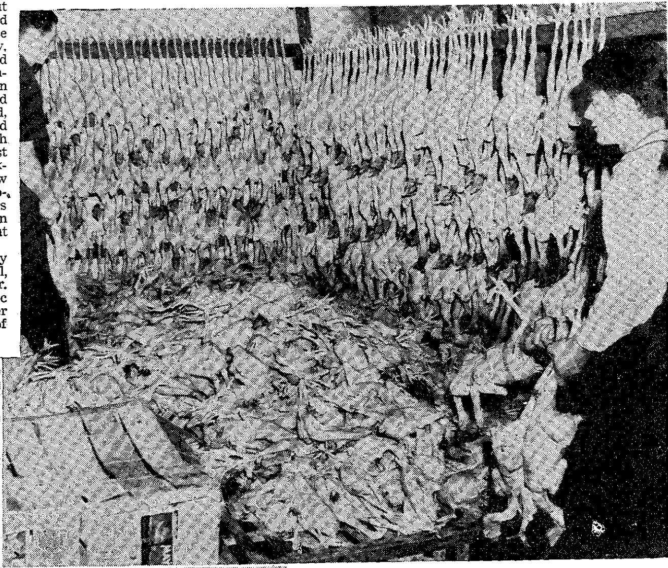
"Black-market" ice box is taken over by W.P.T.B. enforcement officers to make inventory of dressed poultry.

After preliminary investigation by Andre Demers, K.C., enforcement counsel, the inquiry was conducted by Hon. Mr. Justice Joseph Archambault of the Quebec Superior Court as a commissioner under the Inquiries Act, to investigate the sale of poultry.